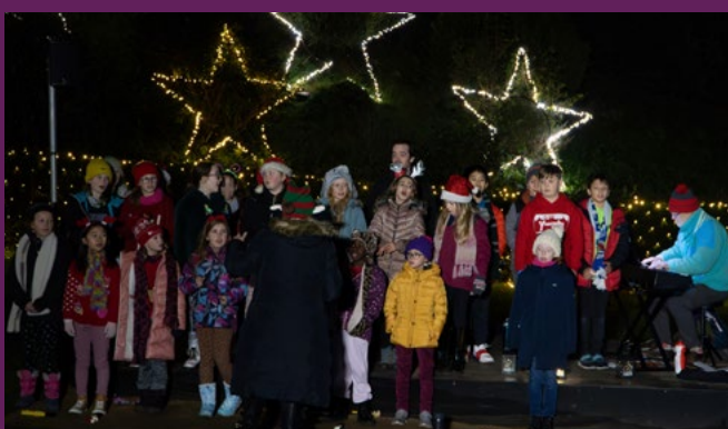
Warwickshire Youth Choirs at Warwick Castle