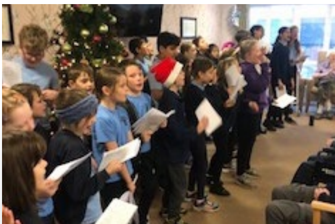
Westgate Primary School wellbeing choir

Congratulations to all the children who have been out and about bringing Christmas Cheer to so many local residents.