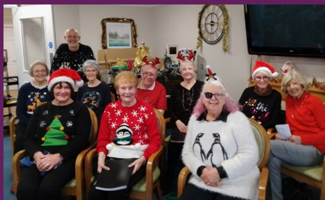
Singing for Pleasure at Cherry Tree residential home

www.warwicksingingtown.co.uk/get-involved/