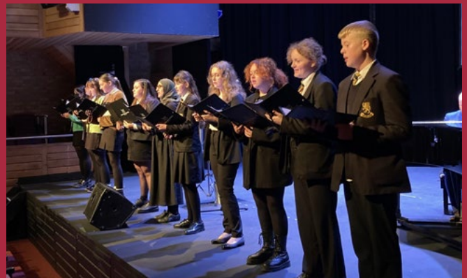
Big Local Night Out – Aylesford secondary school choir

Tickets: www.bridgehousetheatre.co.uk/show/the-big-local-night-out/