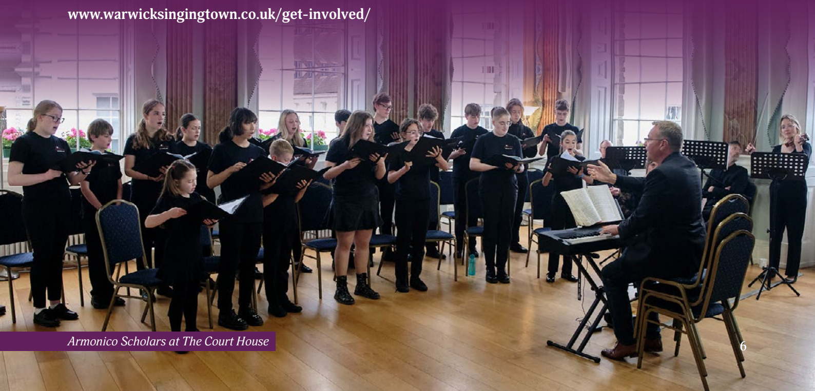
Armonico Scholars at The Court House