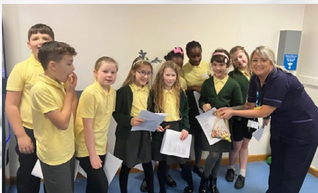
Woodloes Primary School wellbeing choir