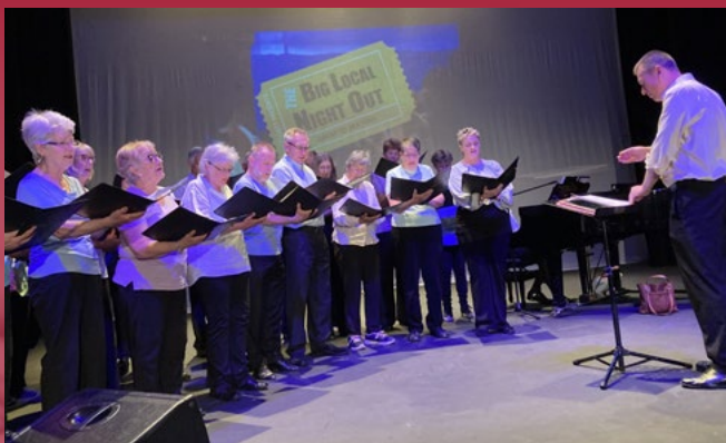
Big Local Night Out – Village Voices