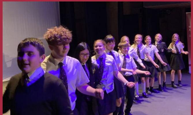
Big Local Night Out – Myton School choir