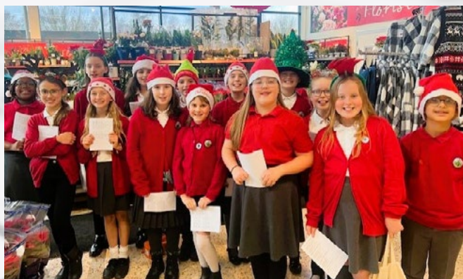
Coten End Primary School wellbeing choir