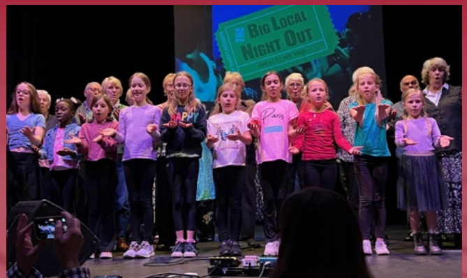
Big Local Night Out – Singing for Pleasure and Warwickshire Youth Choirs Junior Girls