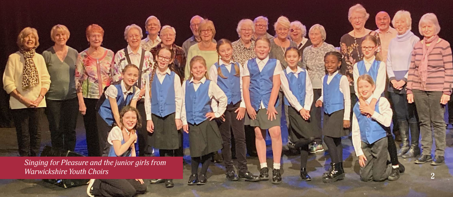
Singing for Pleasure and the junior girls from Warwickshire Youth Choirs

A fabulous evening proved once again that nothing brings a community together like a good sing!