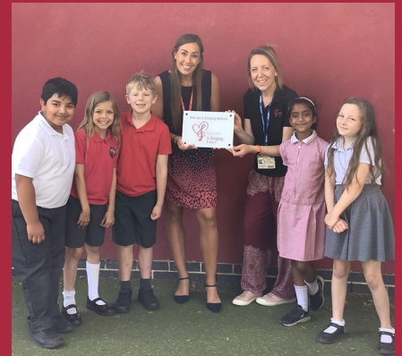
Coten End Primary School