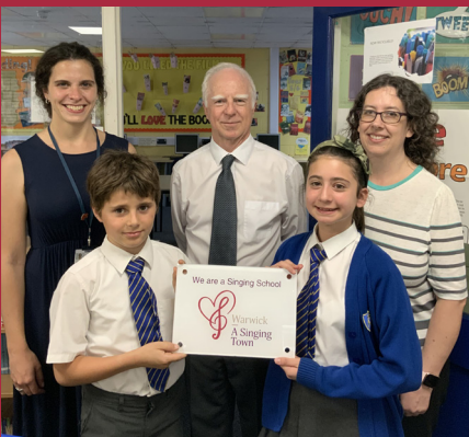
St. Mary Immaculate Catholic School