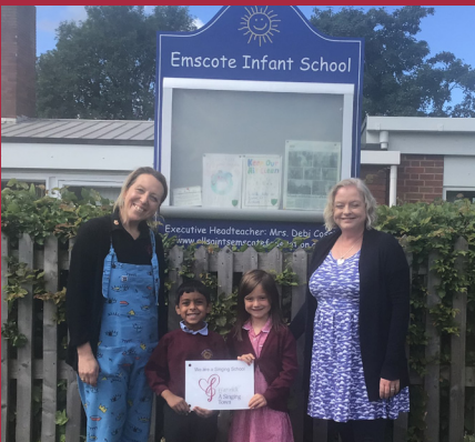
Emscote Infant School