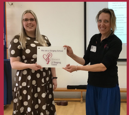
Woodloes Primary School