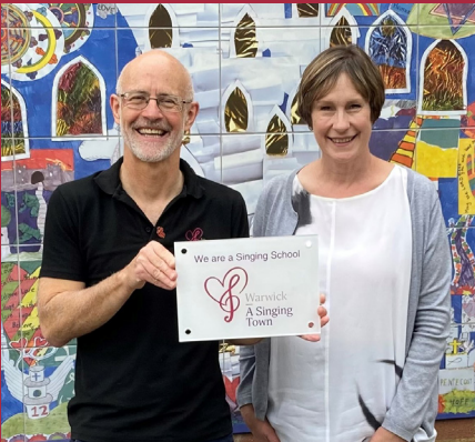
All Saints Junior School

We are thrilled to be working with nine partner schools and they are all very happy to be singing schools supported by Warwick – A Singing Town.