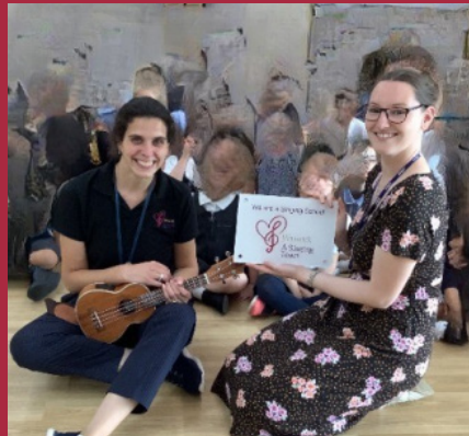
Aylesford Primary School