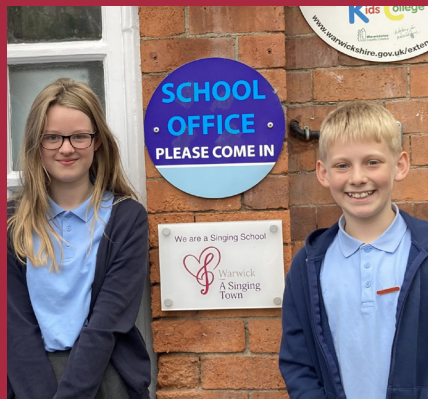
Westgate Primary School