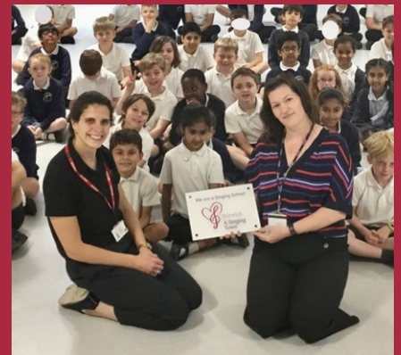
Heathcote Primary School