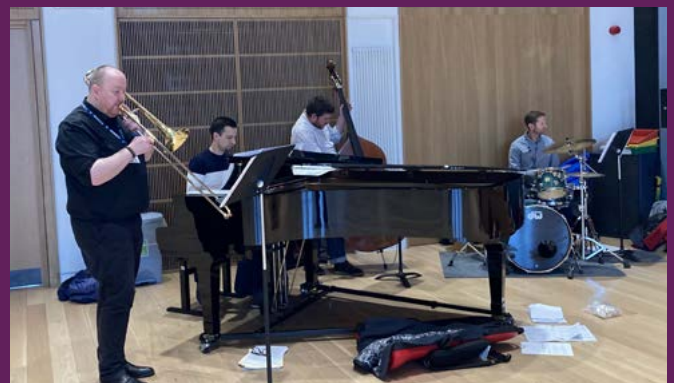
The House band